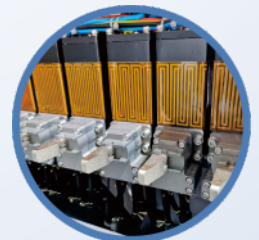
Negative Ink Pressure Supply System