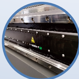
Optional Magnetic Linear Motor