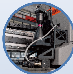
Optional CPS (Camera Positioning System)