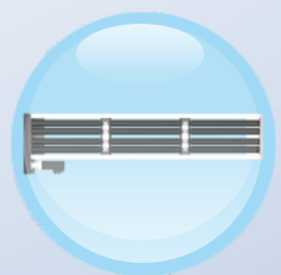
Optional Cylinder Printing Kit