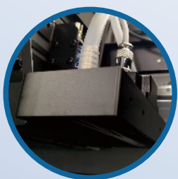
4 Water-cooling LED UV Lamps