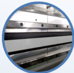
Steel Beam with Dual Linear Guides